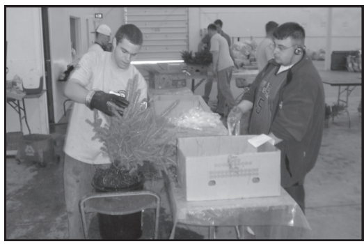
West Seneca Americorps members assisted with the preparation of tree and shrub seedlings for distribution to Erie County residents.

The District's annual Tree and Shrub Seedling Sale was held on April 23rd. Through this year's program, a total of 56,000 tree and shrub seedlings and transplants were distributed to Erie County residents for planting.