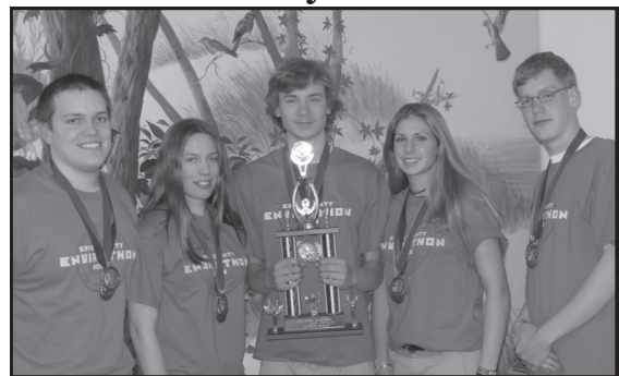
Springville High School's Envirothon team won the Erie County Envirothon and represented Erie County at the New York State Envirothon, where they placed 5th out of 50 teams from throughout New

Congratulations to Springville High School's Envirothon team—the 2005 Erie County Envirothon first place winners! Coordinated by Erie County Soil and Water Conservation District, the Envirothon is an annual educational competition that challenges students in the environmental conservation topics of forestry, soils, wildlife, aquat-