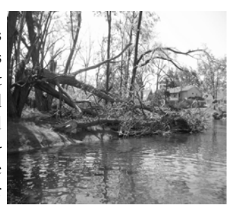
Stream debris in Ellicott Creek

completion but will most likely continue throughout the summer. When not involved with stream debris removal, The District continues its' focus on water quality protection through multiple grant funded projects in the Buffalo and Eighteenmile creek watersheds. Earlier this spring, riparian plantings were installed at projects in Lancaster and Aurora to further enhance the stream corridors. Additional survey, design and construction is planned for streambank stabilization projects located in Alden, Boston, Concord, Eden and Elma. Is there a creek located along your property? Does it need your help? Did you know that most waterways in Erie County have been impacted by development over the years? The District encourages everyone to be proactive in protecting our local water resources. Visit the District website or stop into the office for information on simple practices anyone can apply to improve the health of your stream.