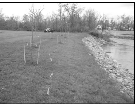
Riparian tree plantings and biotechnical stabilization techniques along Cayuga Creek in the Village of Lancaster

Once the snow was cleared, trees removed and power restored there still remained additional work to be done, specifically along our local creeks and streams. The Soil & Water Conservation District ac-