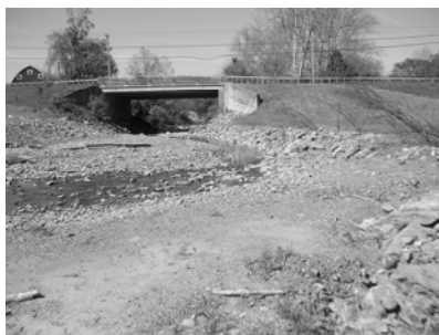
After Photo: Landon Brook site

The project improves water quality within the 18 Mile Creek Watershed by reducing sediment inputs into the stream; sedimentation being one of the largest sources of pollution in the watershed.