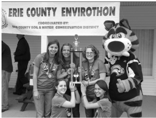
Springville wins the 2009 Erie County Envirothon!