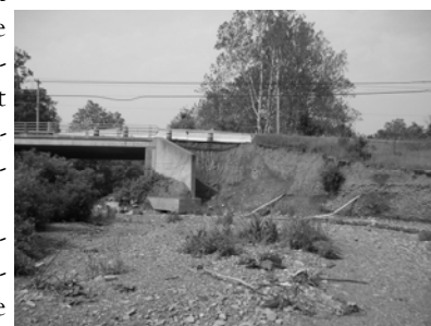
Before Photo: Landon Brook site

In October of 2008 the District secured the services of local contractor Eastwood Industries Inc. to complete the largest stream restoration project to date through the program. The main objective was to protect Boston State Road and the bridge over Landon Brook. The project stabilized approximately 800 linear feet of streambank and included 400 feet of longitudinal peaked stone toe protection, channel alignment modification, the installation of four rock grade control structures to stabilize the stream bed and hundreds of biotechnical plantings to restore the stream to its proper form and function.